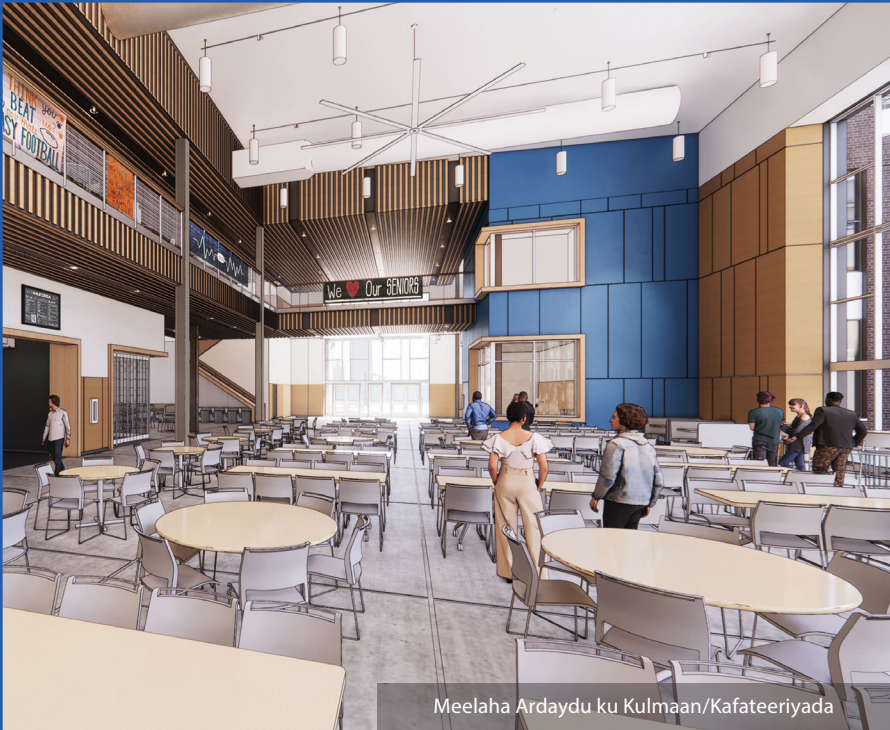
Meelaha Ardaydu ku Kulmaan/Kafateeriyada