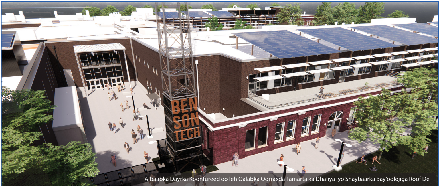
Albaabka Dayrka Koonfureed oo leh Qalabka Qorraxda Tamarta ka Dhaliya iyo Shaybaarka Bay'oolojiga Roof De